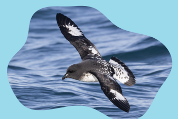
Snares Cape petrel / karetai hurukoko