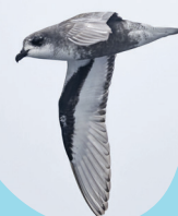
Mottled petrel / kōrure