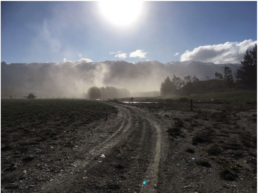
Sent from my iPhone