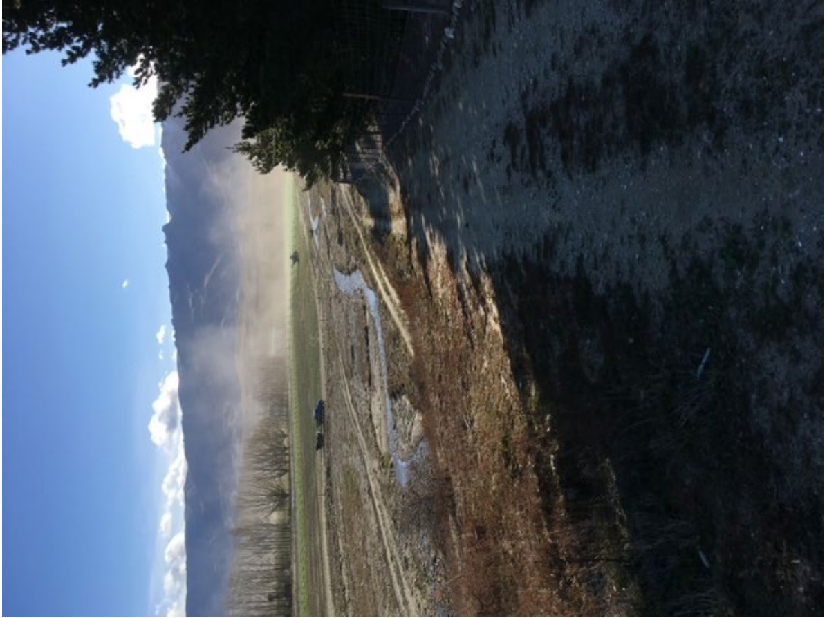
Sent from my iPhone