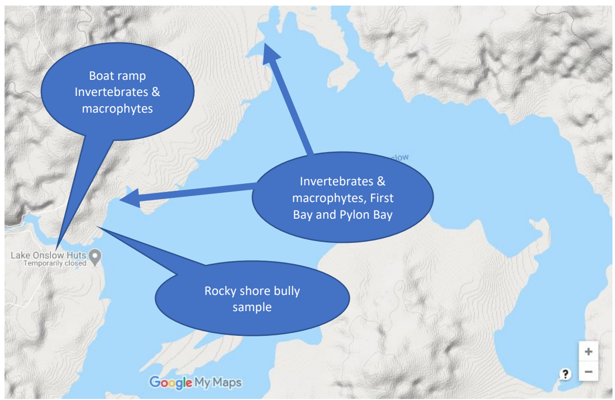
Figure 1, location of sampling sites.

Lawa water quality data will be referred to in the reporting of the monitoring results.