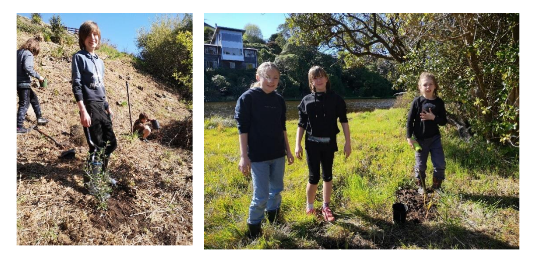
Big Rock children actively volunteering their time for planting in the Ōtokia Wetlands