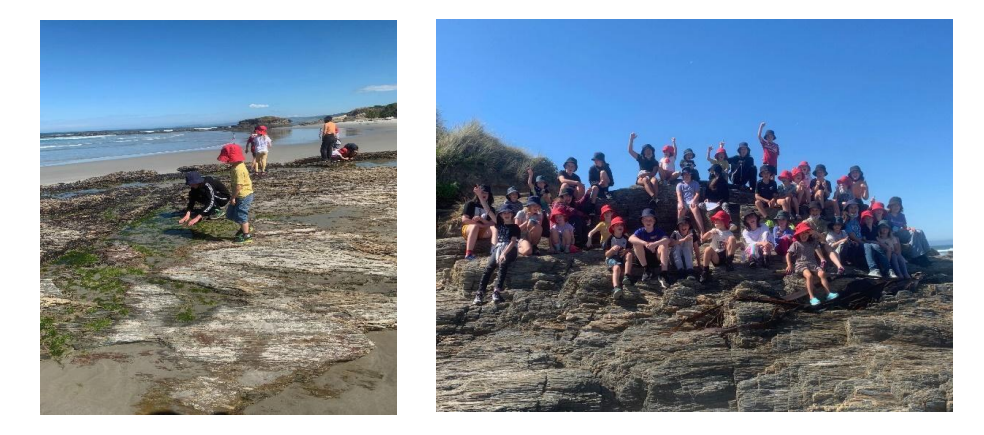
The Beach and Creek are used as an Outdoor Classroom for Students so as to bring their learning genuine relevance but also to celebrate their amazing local environment

9. These conversations indicate that if the landfill goes ahead the children may be scared to use the beach or surrounding areas because of the risk of water contamination. The perception of this risk should not be underestimated. We have learnt from Covid, that perception of illness or death is very strong in children and causes immense anxiety. Covid anxiety is huge in children. In my experience, so is the fear of contaminated water.