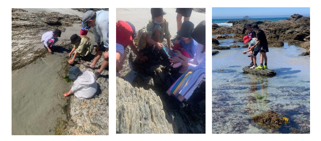
Children learning at Brighton Beach. science integration with Education Outside the Classroom. Part of our Learning About, For and In the Environment