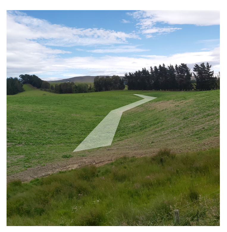
The marked area above is a critical source area.

Sometimes they are very small and subtle, others are large and obvious.