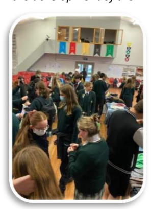
Bayfield students' clothes sale

are enabled to participate in a genuine way empowering them to become active environmental citizens for life and enriching the development of the whole school / centre environment.