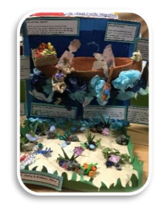
The Pacific migration story

vear looking at local legends and evidence of the arrival of the first people in the area. This year they focused their inquiry on the journeys of Pacific people across Te Moana-nui-a-Kiwa since 900AD. Students learnt about the skills necessary to cross the Pacific Ocean, including star maps, bird migrations, wave patterns and seasonal winds. The students created displays for the local museum to share the things they had learnt with whanau and the community.