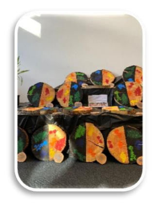
Hawea Flat students Matariki artwork

Ōtākau schools have been celebrating Matariki for many years and having a national holiday to mark Matariki highlights how important this time of year is for reflection, honouring those that have come before us and planning for kōanga. Hawea Flat School celebrated Matariki this year with a school wide series of events and workshops. The whole school welcomed new students with a Powhiri and a tree was planted for each family (a school tradition). Arts and crafts were created by