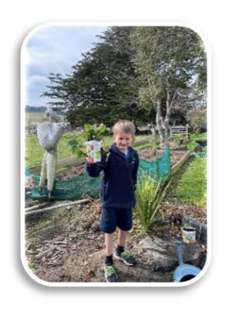
Waiwera South student with upcycled strawberry planter

Waiwera South School recently did a waste audit and are now working out their next steps to get school waste into the right places and to reduce the waste. They up-cycled yogurt pottles as strawberry planters so students could take a plant home. They also have great plans for the garden.