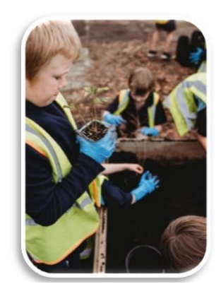
Waitaki Valley students potting native plants

Talk to your facilitator if you want to find out more about any of these stories or if you want support with sustainability learning and mahi at your school.