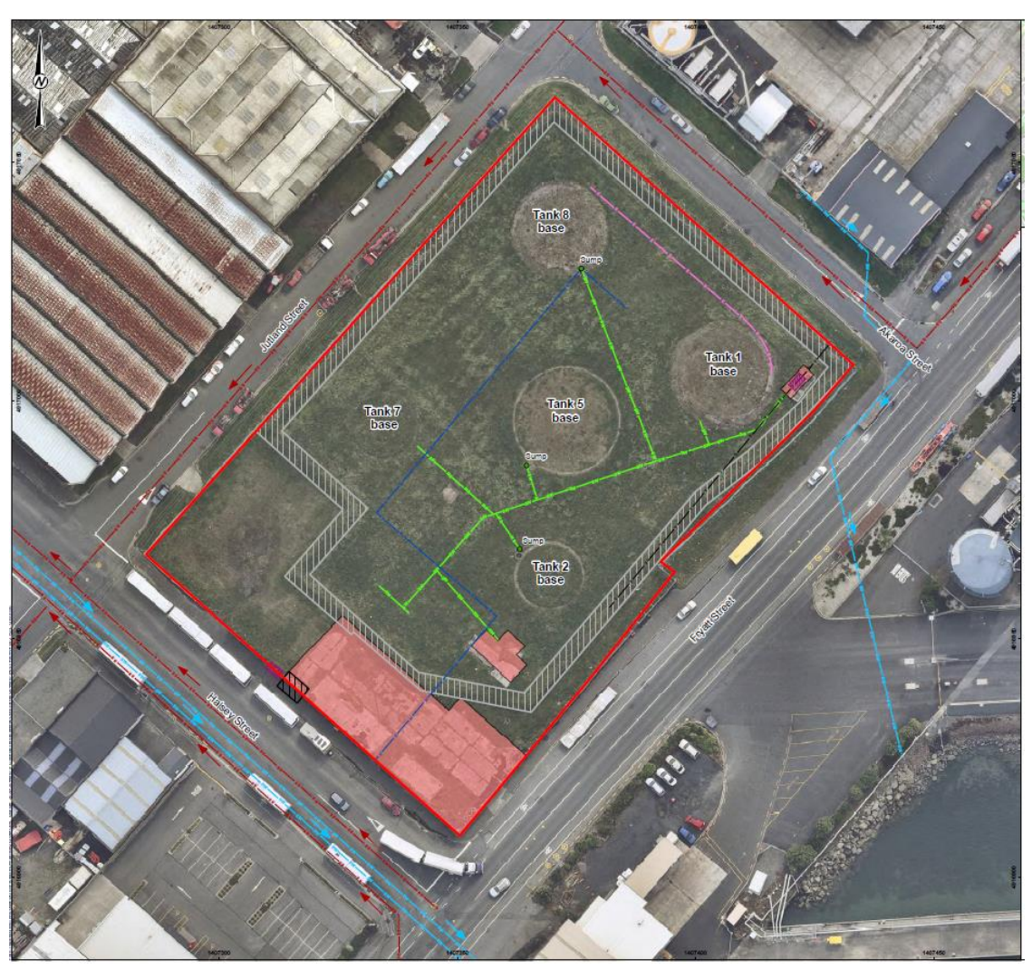
Figure 2 Aerial photograph of site showing locations of various elements remaining on site.

Adjacent land uses and owners are shown in Figure 3. These comprise a range of commercial and industrial land uses.