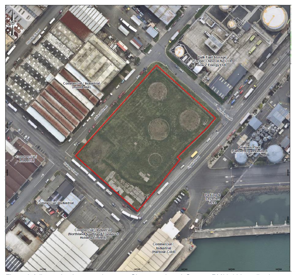
Figure 3 Adjacent land uses and owners. Site extent in red.