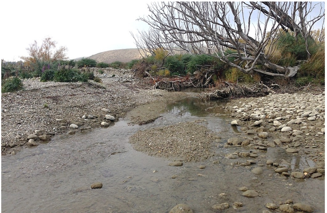
Image 3. 22nd April 2015 Lindis River 1,100 L/s - South braid.