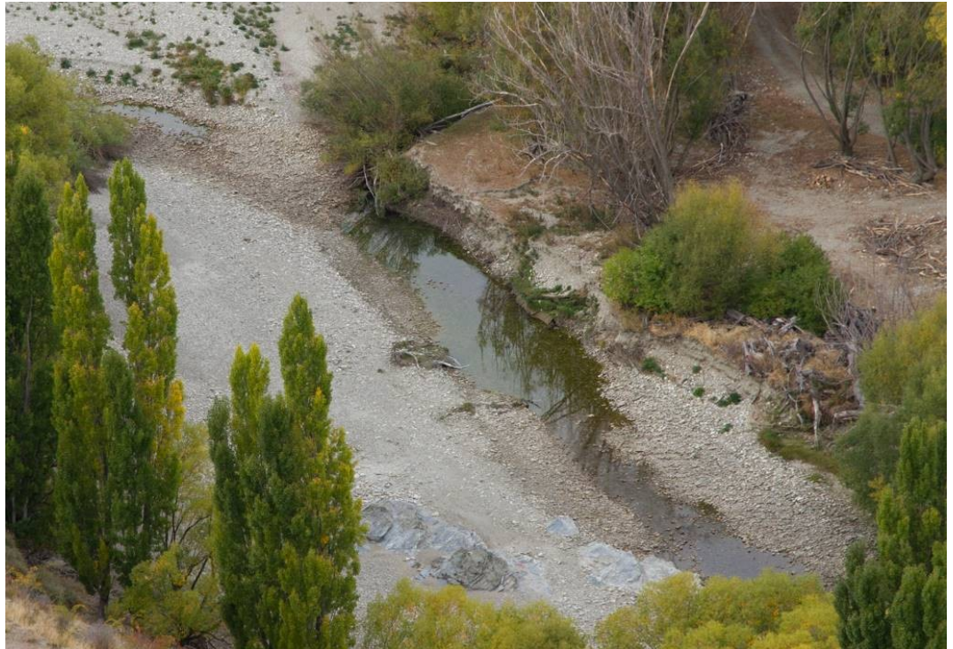
Image 1. 15th March 2014. Small section of standing water found between dry reaches.