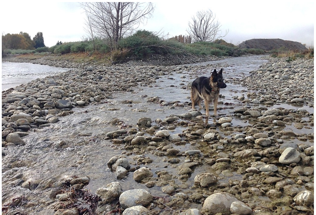
Image 2. 22 nd April 2015 Lindis River 1,100 L/s – Southern split of the north braid looking upstream.