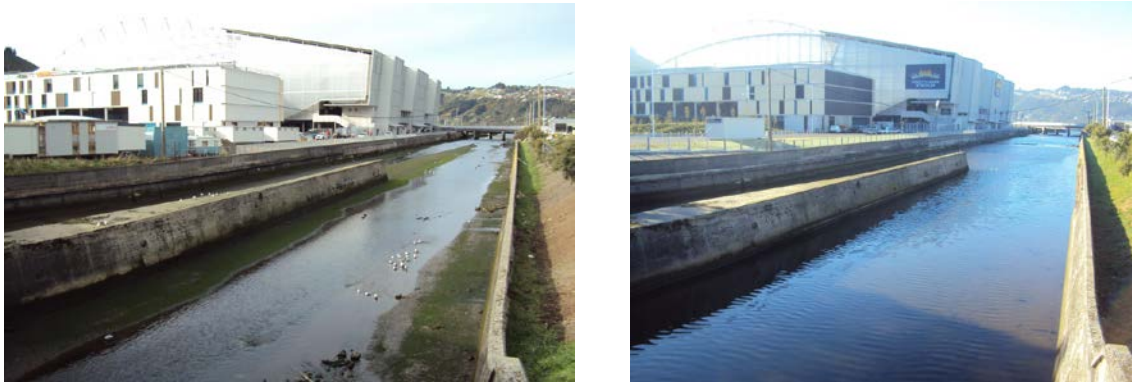
Figure 2: Water of Leith at low tide, before (left) and after (right) the construction of weirs downstream of ANZAC Street in 2011.

Engineering works on the Union to Leith Footbridge stage of the Scheme are progressing (Figure 3). The removal of asbestos-contaminated soil is substantially complete. The asbestos is being excavated and removed from site in accordance with a plan approved by WorkSafe NZ and the University of Otago. Works to increase the height of the right bank wall are well underway.