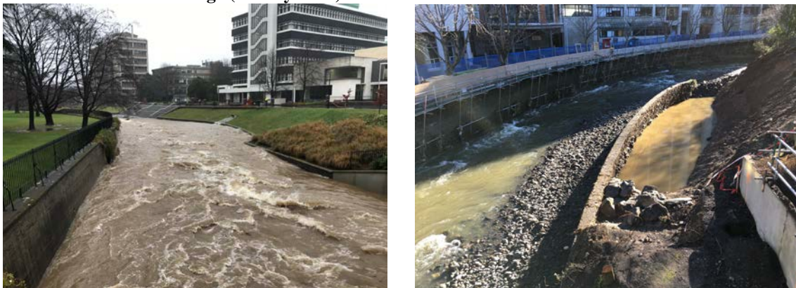
Figure 4: Leith Flood Protection Scheme following the flood event on 21 – 22 July 2017.