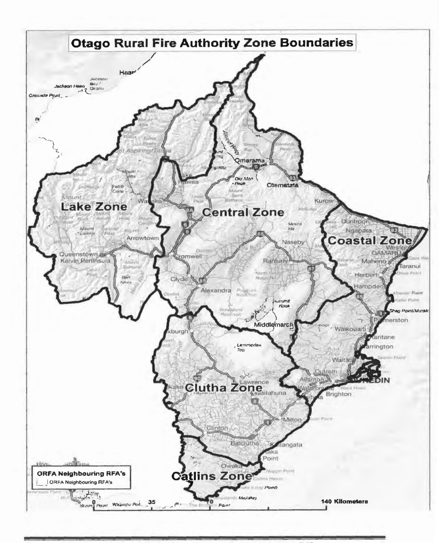
Submission ORC Civil Defence Glen Callanan Clyde Overall Plan