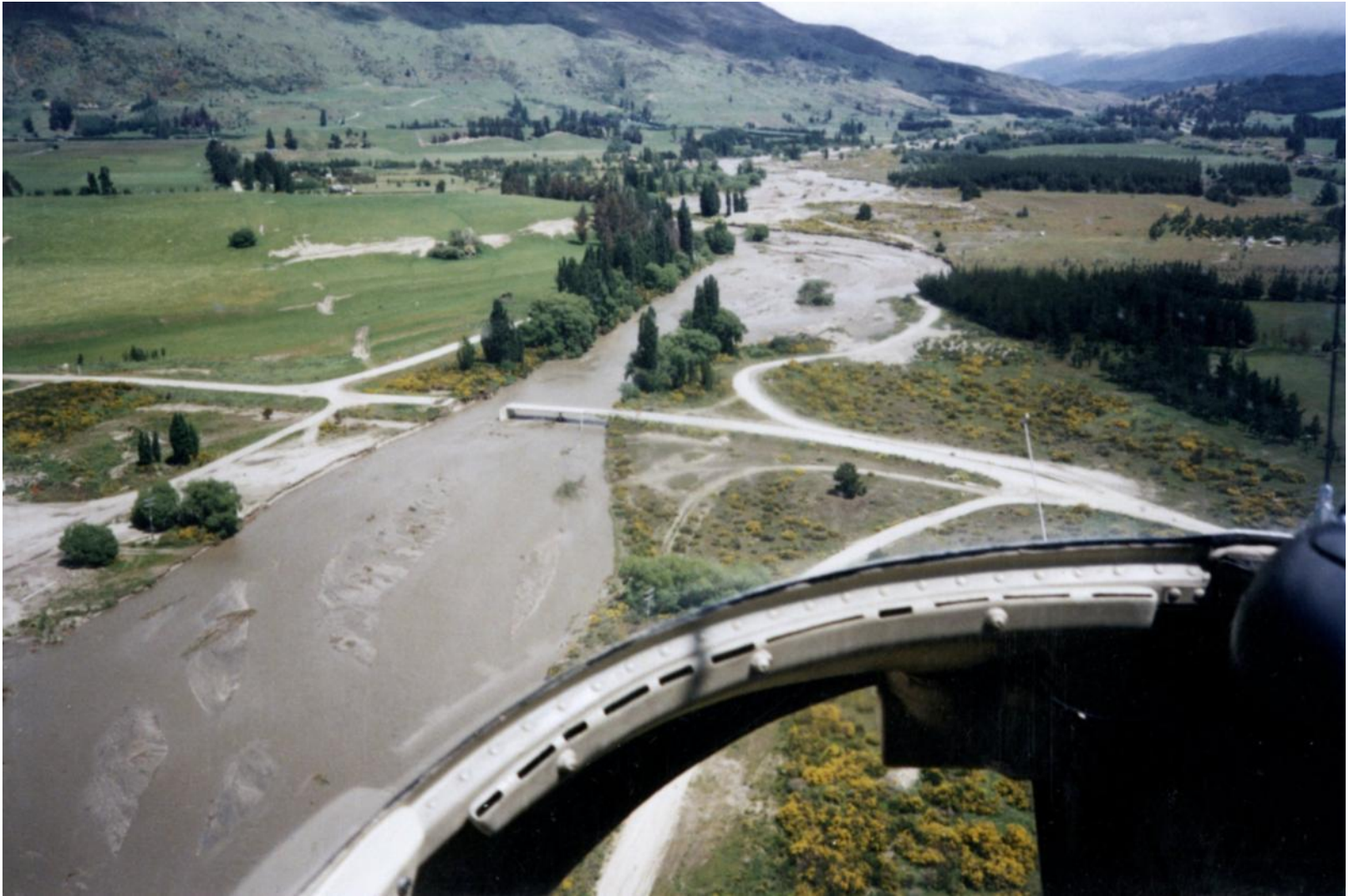
Bank erosion, channel migration