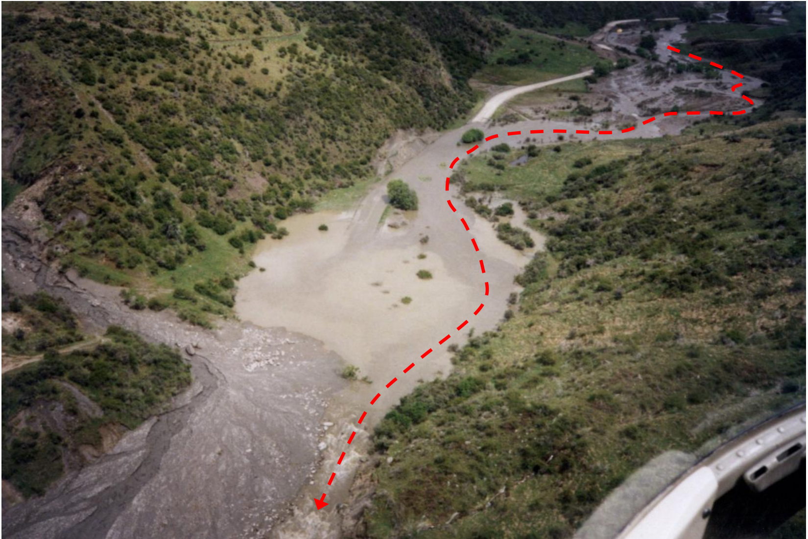
Debris flows in tributaries