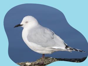
Black-billed gull / tarāpuka