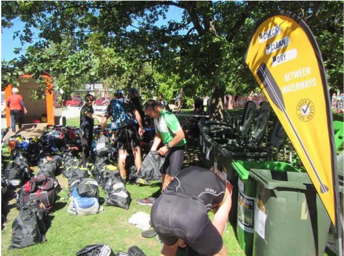
Figure 1: Check Clean Dry decontamination station at MacPac Motatapu in Arrowtown on 10th March 2018