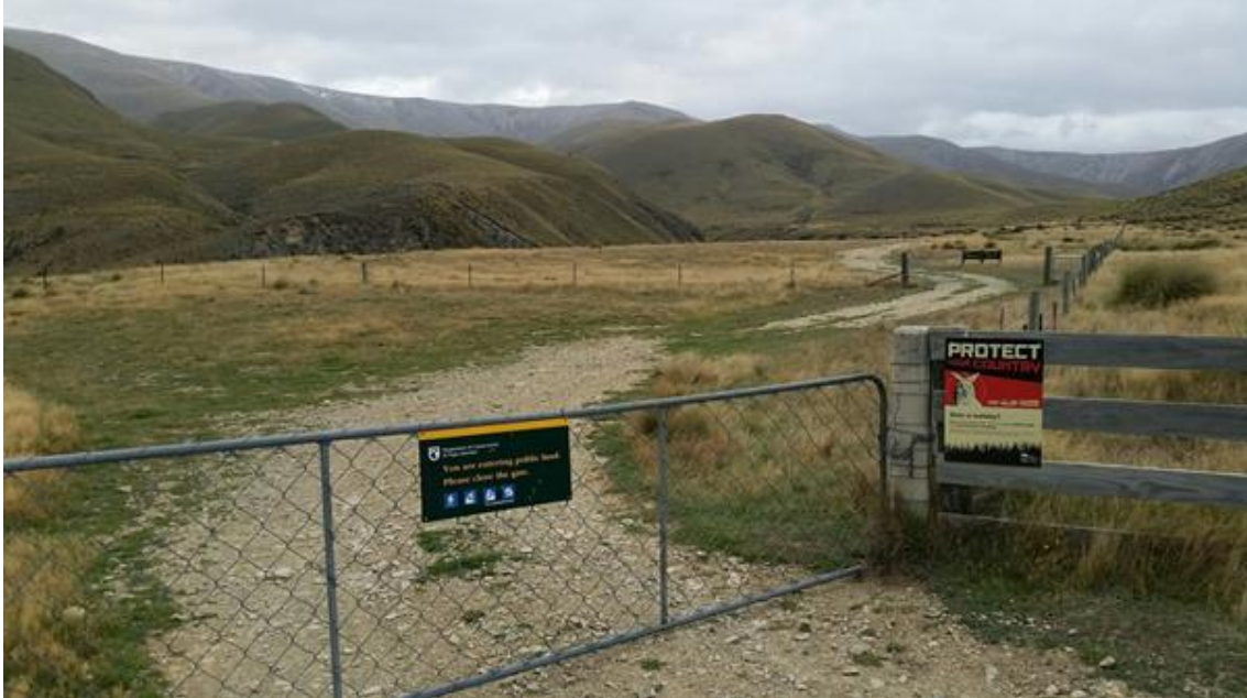
Figure 2: Wallaby signs posted at hunting locations in Central Otago

To increase wallaby publicity, signs are now being erected at popular hunting places in Central Otago.