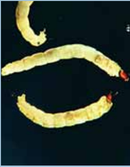
FRESHWATER INVERTEBRATES