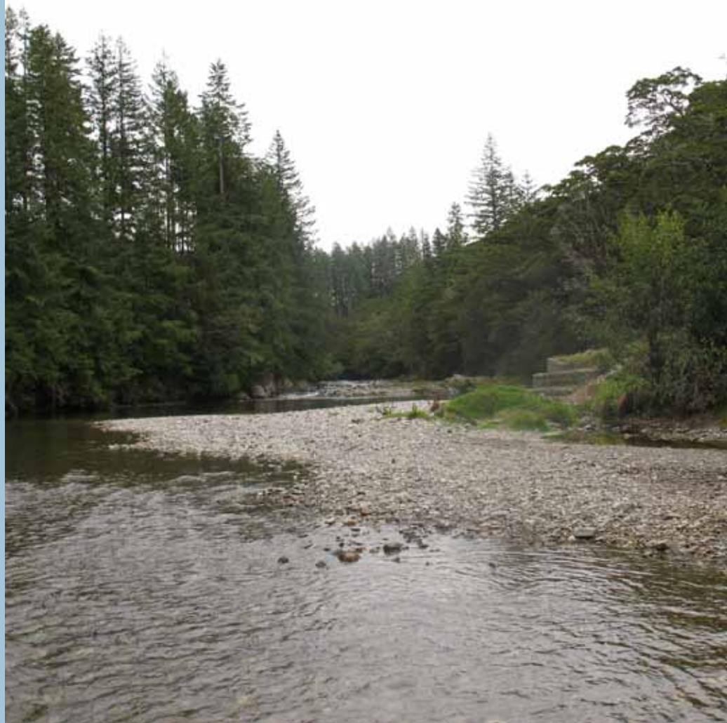
POMAHAKA RIVER AT GLENKEN

Further information on recreational water monitoring is available at www.orc.govt.nz under 'quick links'.