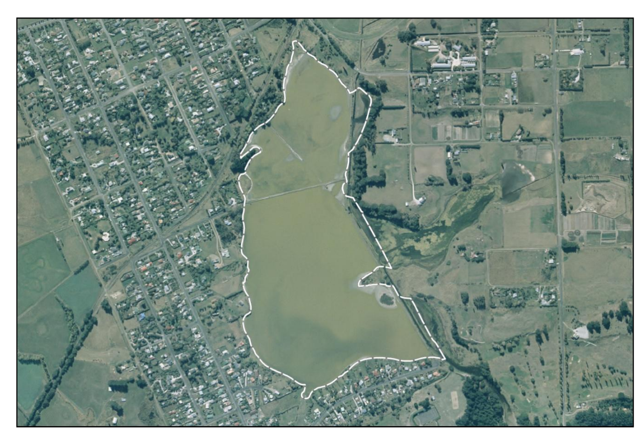
Aerial view of Hawksbury Lagoon (March 2006)