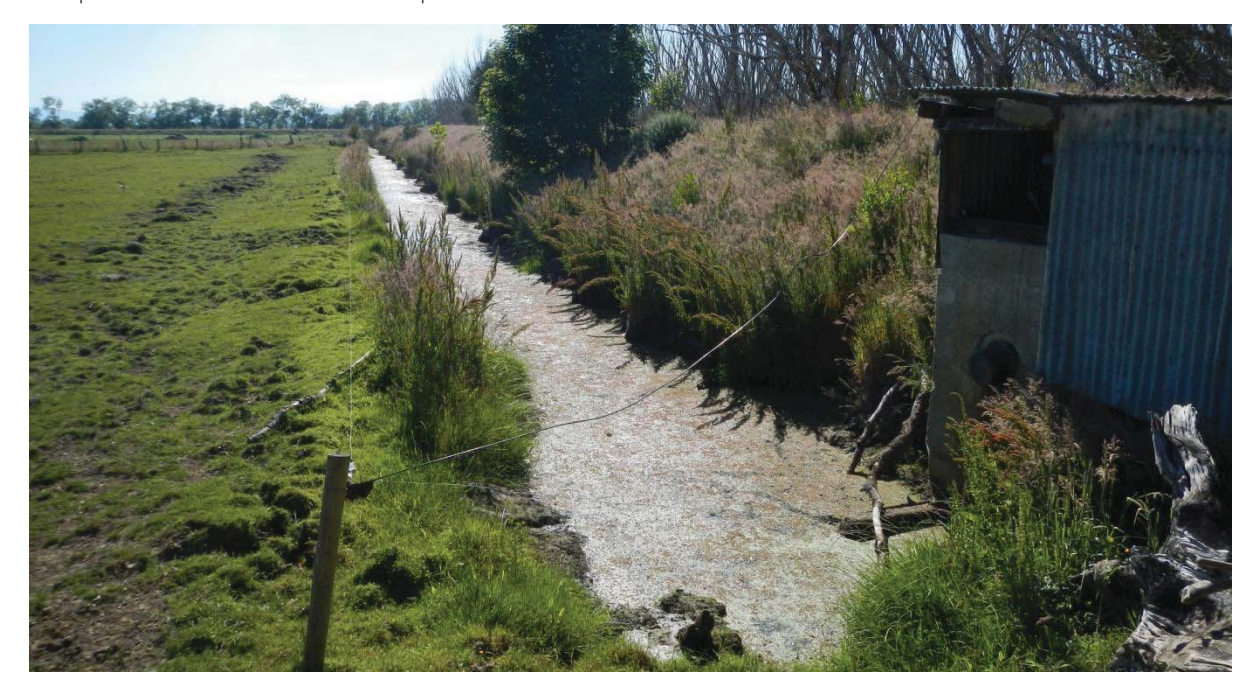
Figure 2: The floodbank, drain and pumpstation that separate the pastureland on the Beaton property from the Waipori/Waihola Wetlands Complex.

The purpose of the floodbank is to prevent inundation of pastureland at times when the water level of Lake Waihola rises to flood level. The presence of the floodbank, however, hampers the run-off of excess rainwater from this pastureland into the Lake during severe rainfall events. Runoff from the pasture land is therefore collected in a drain located between the floodbank and the pasture land (Figure 2). The pump station is used for the pumping of water from productive land (pasture) into the Waipori/Waihola Wetland Complex.