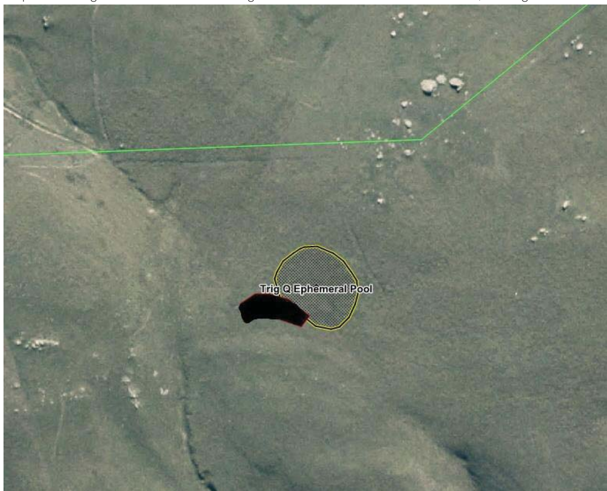
Figure 1: Trig Q Ephemeral Pool (The thin line shows the wetland boundary proposed under Plan Change 2. The darkened area shows the approximate location of the wetland as identified during the Wildland assessment).

The Wildland assessment (Wildland Consultants, 2011, p3) also revealed that the actual wetland is located slightly to the southwest of the area marked as wetland in the proposed new F-series of the Maps to the Regional Plan: Water for Otago and that the wetland is much smaller, see Figure 1.