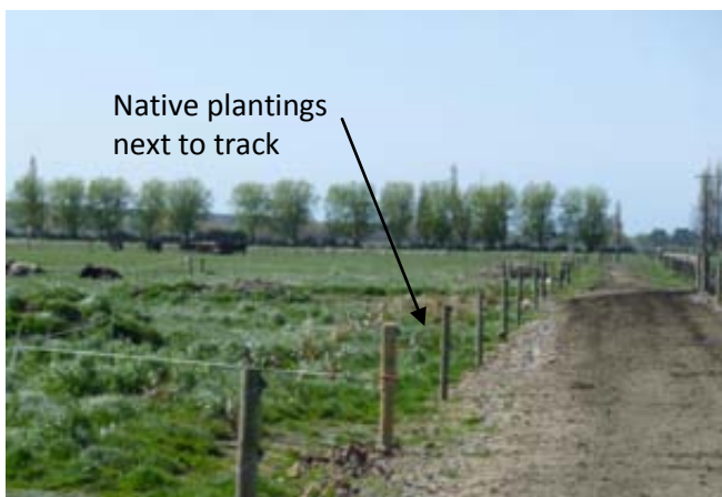
After: Clean dry track - a base of brown rock capped with 50mm of lime race fines from Palmerston, sloped towards paddock, plantings next to track to absorb any runoff and reduce boggiess of paddock.