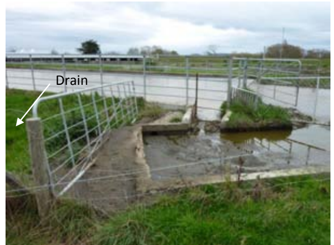
After: Extra height on stone trap so doesn't overflow when cleaning with a digger, drain removed so no overflow can enter a waterway. Yard diversion installed.