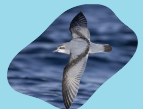
Fairy prion / tītī wainui