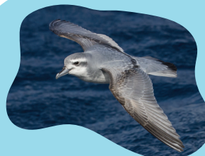
Antarctic prion / totorore