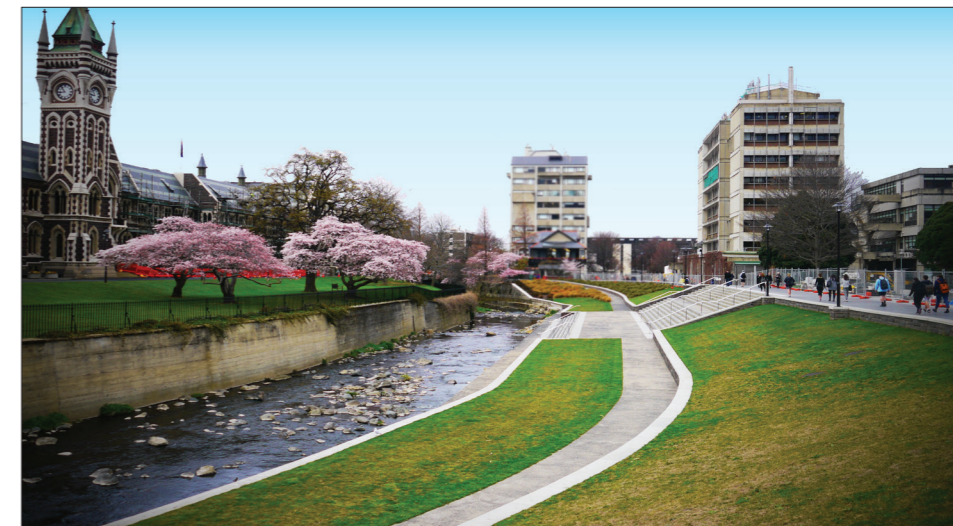
St David St – Union St work opposite the university clocktower in 2016

This is particularly evident on the University of Otago campus. Completed in 2015, the St David St – Union St channel running next to the iconic clock-tower has become an open and inviting focal point for students and the public to engage with the river.