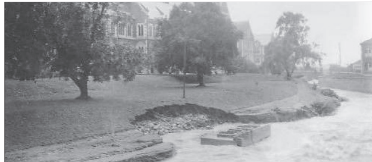
Historic flooding outside the university clocktower in 1923

It involves a series of engineering modifications along the length of the Leith, planned to control floodwaters and help reduce the likelihood of it overflowing and spreading throughout the city.