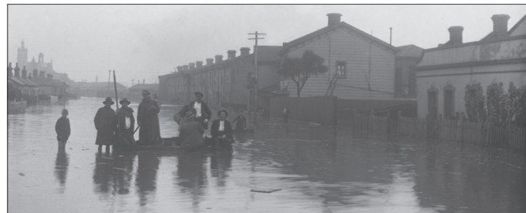
Flooding in Harrow St, 2019

The Leith Flood Protection Scheme is a multi-staged project that has spanned well over a decade. It is funded by targeted Leith scheme rates.