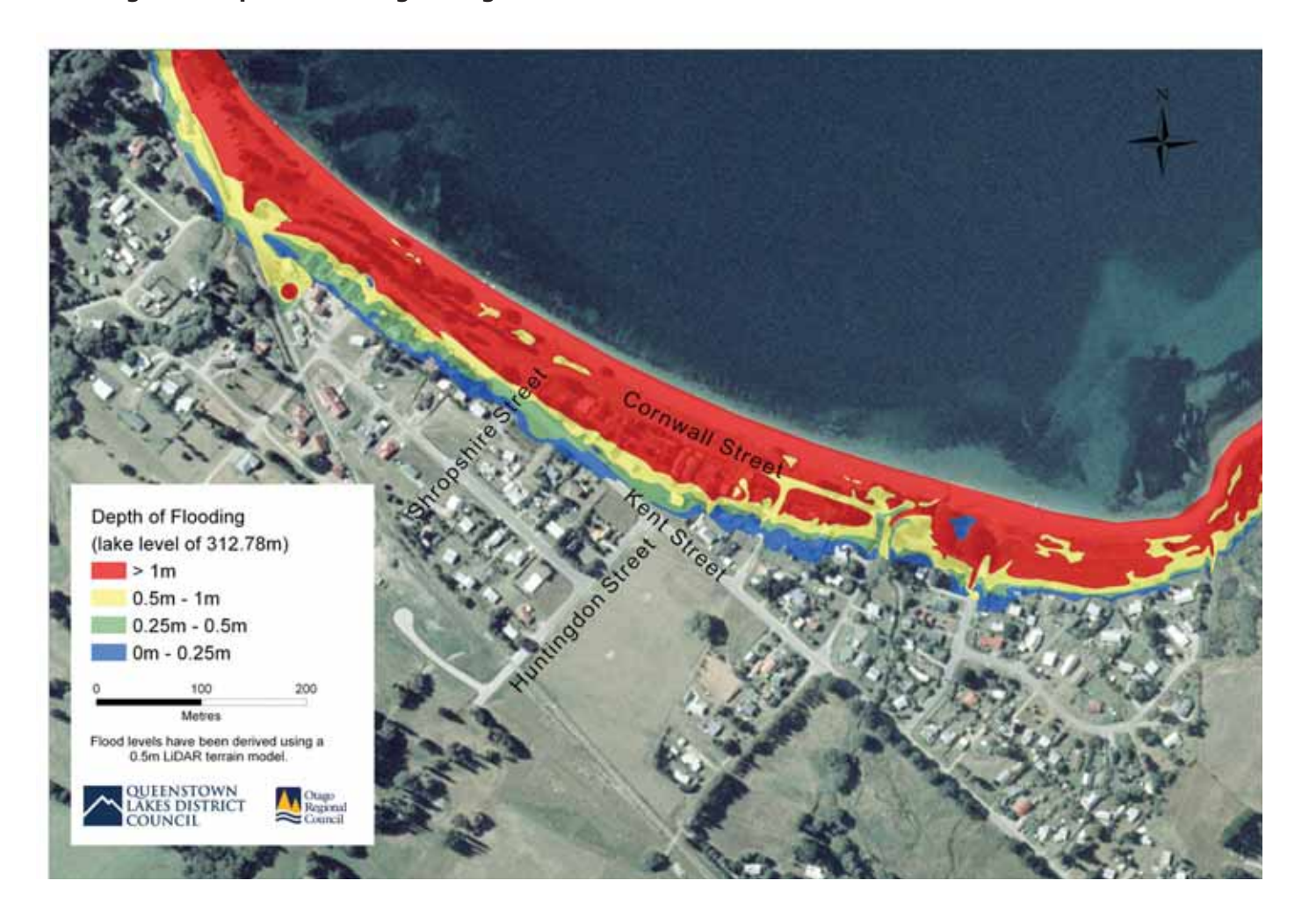
Figure 2. Depth of flooding at Kingston at a water level of 312.78m