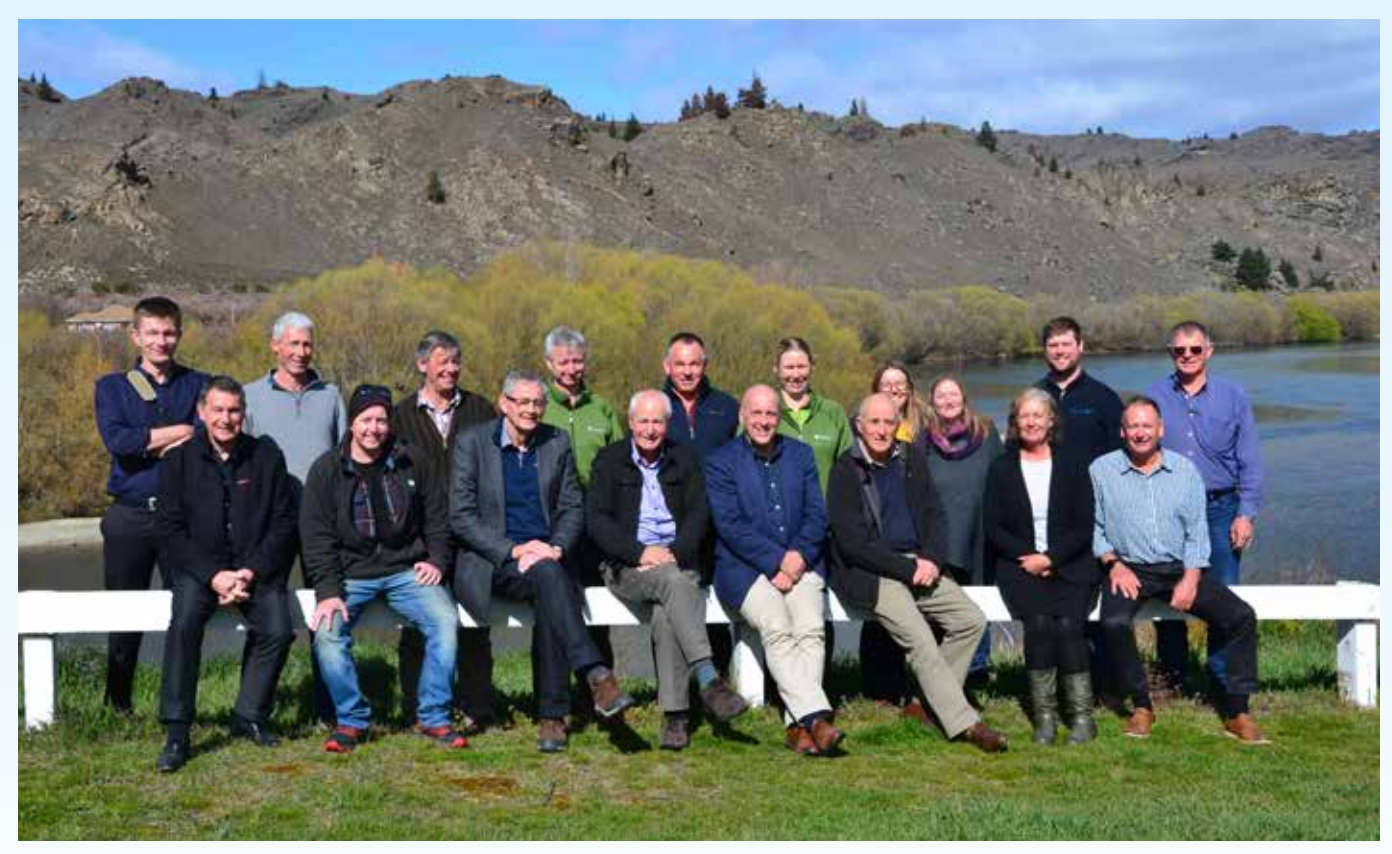
Members of the MRG and ORC staff at the confluence of the Manuherekia and Clutha rivers after a meeting on 11 September.

Anyone farming in the Manuherekia area knows the complexity of the system of races taking and returning water to the river. This complexity is why we're taking a thorough approach (by forming the MRG and TAG) to ultimately determine the values and objectives that will inform the water plan provisions that apply to the Manuherekia Rohe. The rules and limits that result from this process will apply to all water users in the rohe, so it's important that everyone is represented in these discussions.