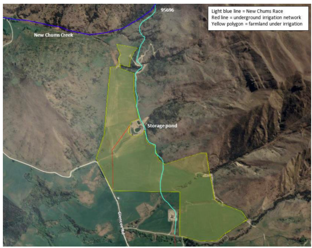
Figure 1: Point of take on New Chums Creek including the race, underground irrigation network, and irrigated areas.