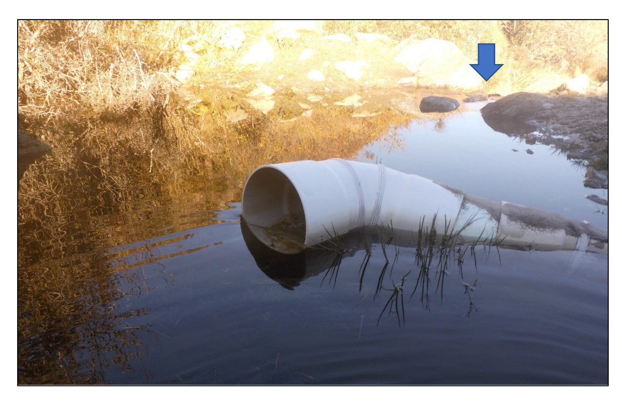
Figure 3: Pipe intake at upper Royal Burn North Branch water take. Intake pipe diameter is 330 mm. Outflow of ponding area is shown by blue arrow. during site visit 13/05/2021.