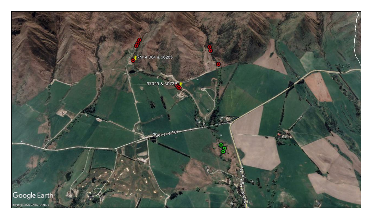
Figure 1: Electric fishing survey sites for the Royal Burn. Red dots = no fish, green dots = brown trout. The existing takes are also shown (sourced from WRM, 2020).