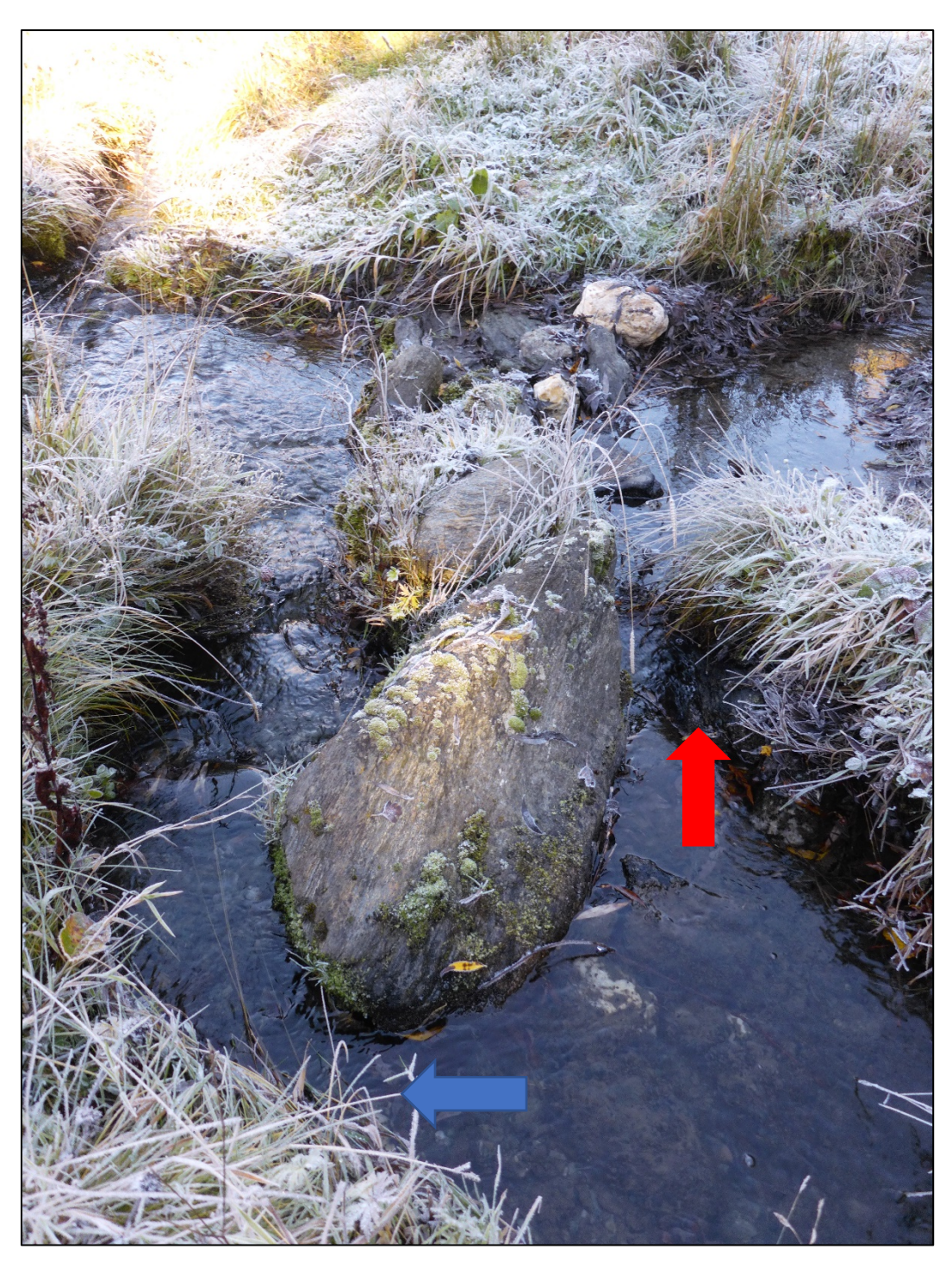
Figure 5: Flow split at the lower take on the North Branch of the Royal Burn. Red arrow indicates the take and blue arrow is the residual flow. Photo taken by Bryony Miller during site visit 13/05/2021.