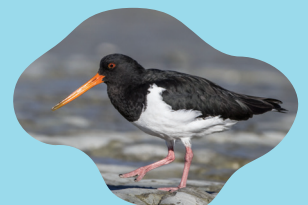
South Island pied oystercatcher / tōrea