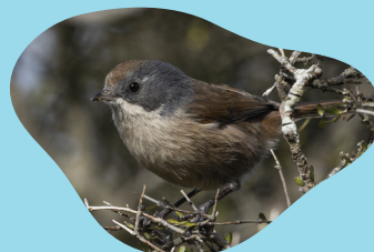
Brown creeper / pīpī