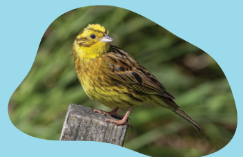
Yellowhammer / hurukōwhai