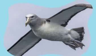
Salvin's mollymawk / toroa