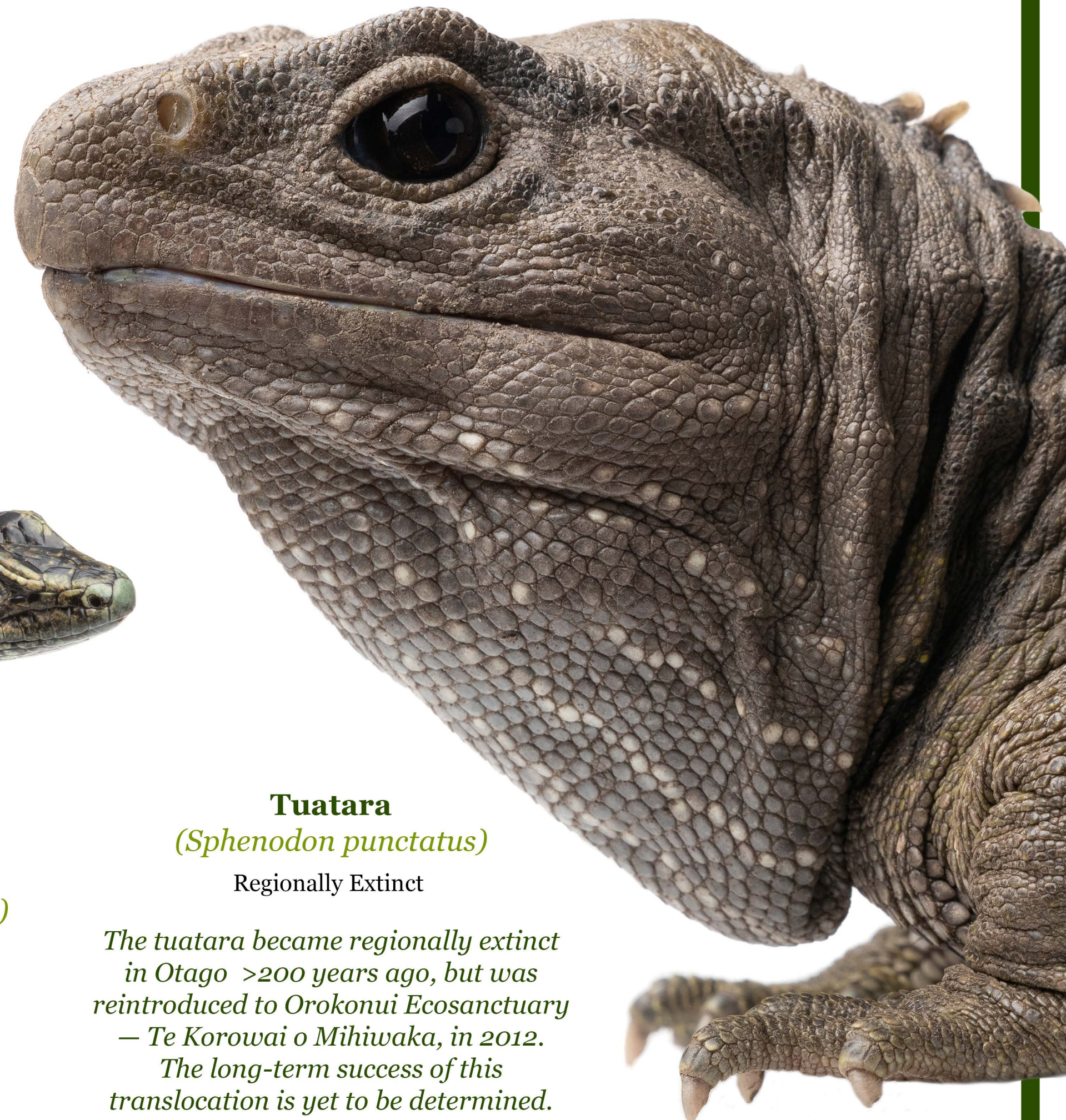
Tuatara ( Sphenodon punctatus ) Regionally Extinct

The tuatara became regionally extinct in Otago >200 years ago, but was reintroduced to Orokonui Ecosanctuary – Te Korowai o Mihiwaka, in 2012. The long-term success of this translocation is yet to be determined.