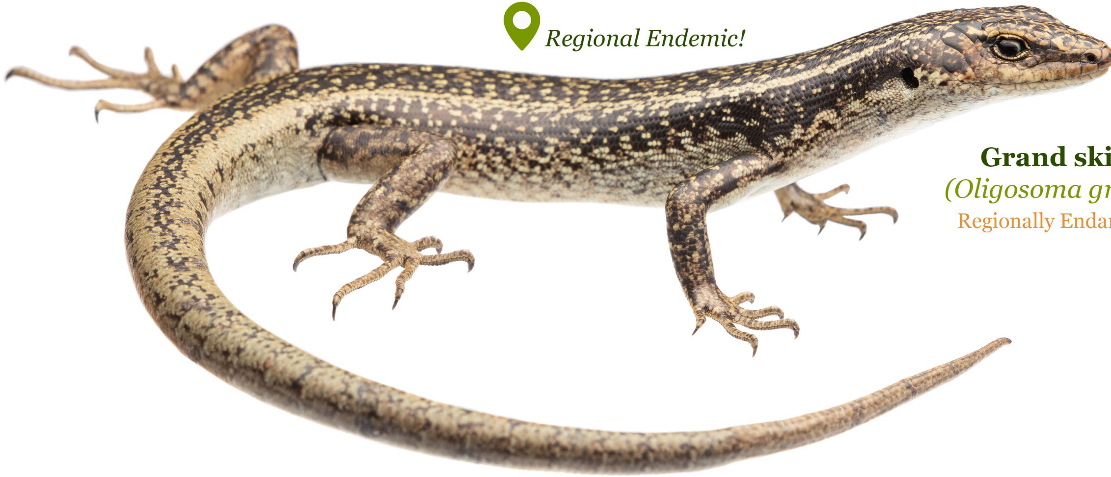
Grand skink ( Oligosoma grande ) Regionally Endangered