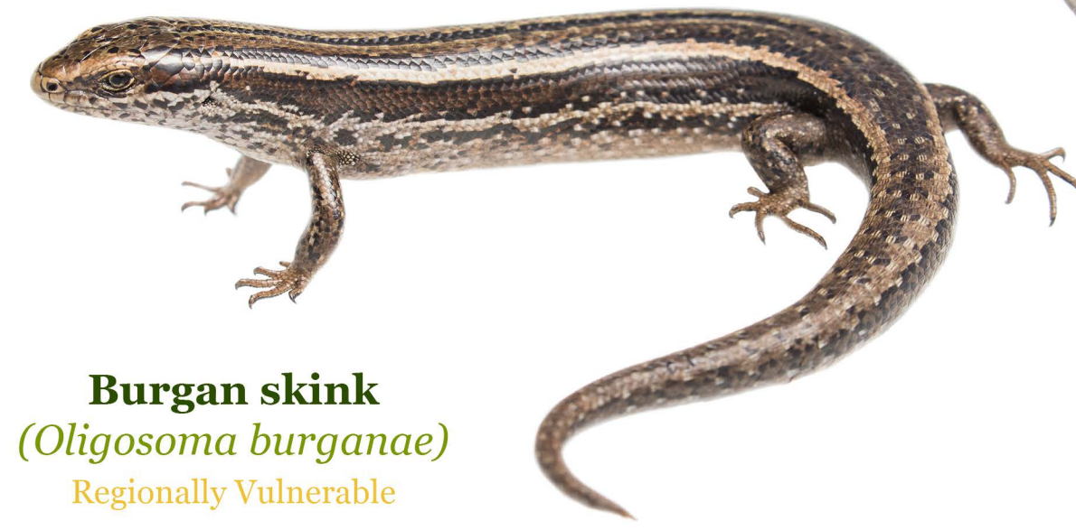
Burgan skink ( Oligosoma burganae ) Regionally Vulnerable