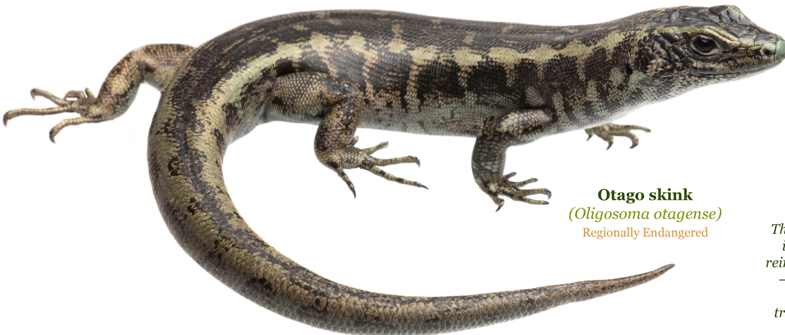
Otago skink ( Oligosoma otagense ) Regionally Endangered