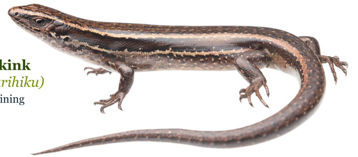
Herbfield skink ( Oligosoma murihiku ) Regionally Declining