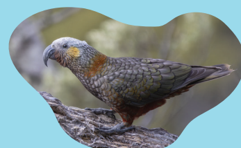
South Island kākā