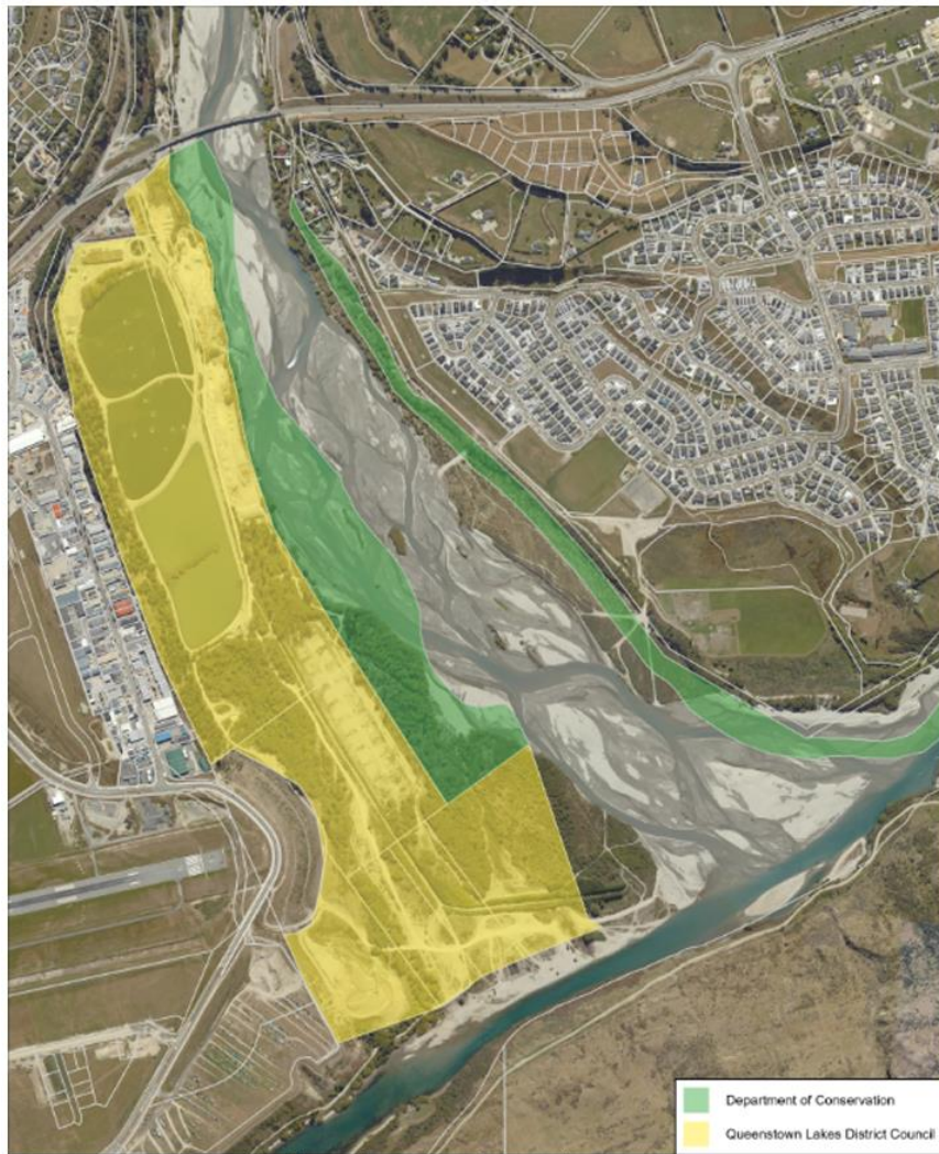
Figure 7: Landownership/administration within the Shotover River/Kimiākau delta and adjacent WWTP area. Unmarked riverbed between the DoC land parcels is crown owned riverbed managed by LINZ.