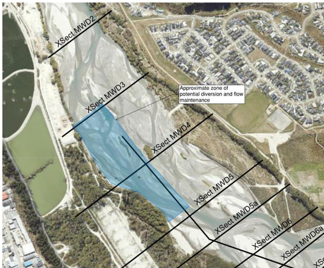
Figure 5: Approximate zone of potential diversion and flow maintenance.

The Section 92 RFI Response states that the proposed diversion channel will: