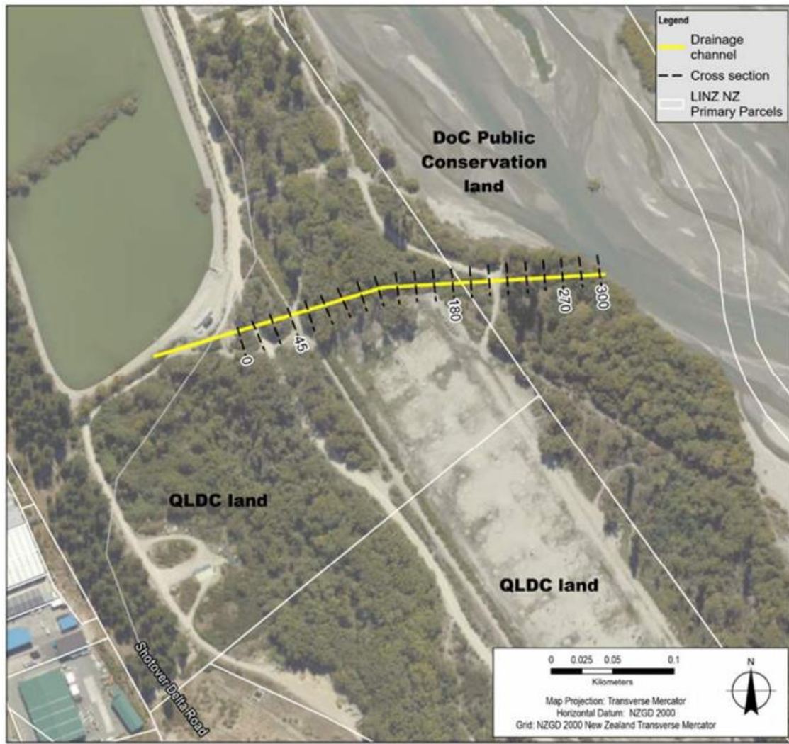
Figure 2: Drainage channel (referred to in this report as discharge channel) and analysed cross sections for hydraulic capacity assessment.