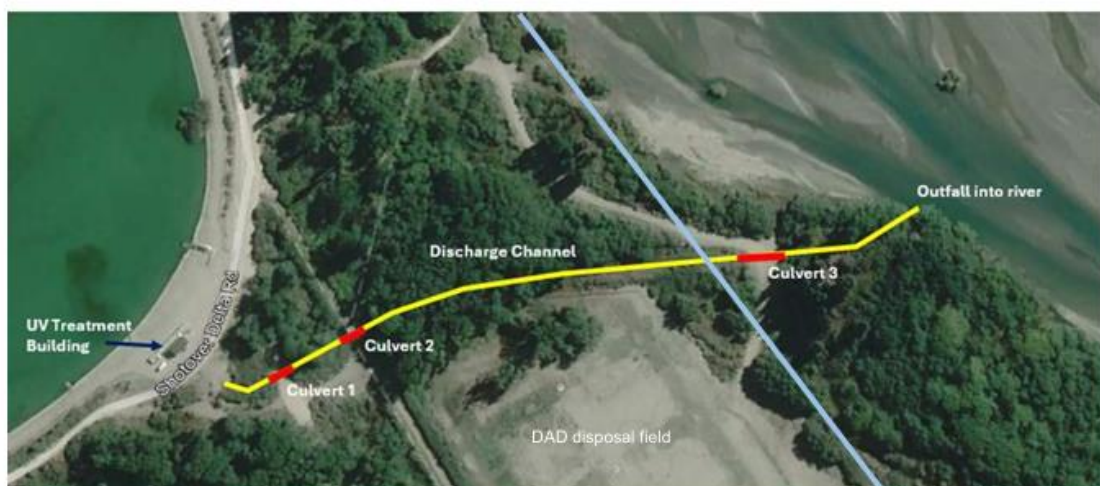
Figure 1: Discharge channel location and layout shown in yellow. Application identifies that the designation boundary is shown in blue.

The Shotover WWTP is located on the true right bank of the Shotover River/Kimiākau, downstream of the State Highway 6 bridge and within the Shotover Delta. The location and layout of the discharge channel and discharge point into the Shotover River/Kimiākau is shown in Figure 1: