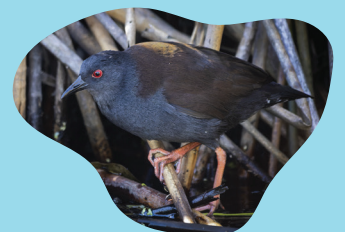
Spotless crake / pūweto