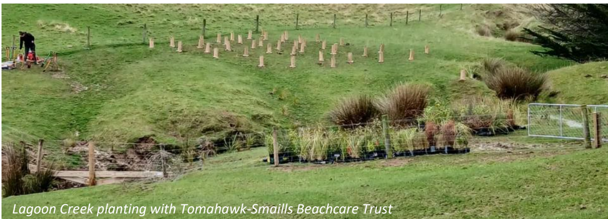
Lagoon Creek planting with Tomahawk-Smaills Beachcare Trust