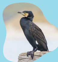
Black shag / māpunga