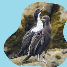
Foveaux shag / mapo