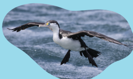
Pied shag / kāruhiruhi