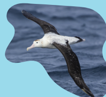
Antipodean albatross / toroa