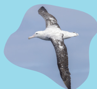
Gibson's albatross / toroa