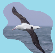
Northern royal albatross / toroa