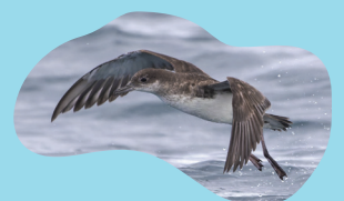
Fluttering shearwater / pakahā