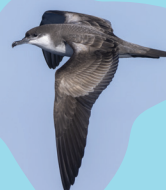
Buller's shearwater / rako