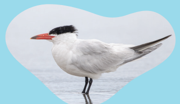
Caspian tern / taranui