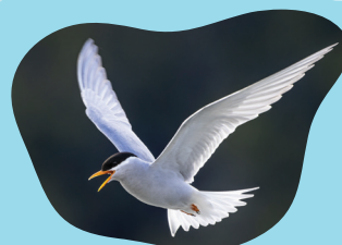
Black-fronted tern / tarapirohe