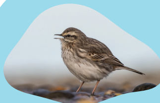
New Zealand pipit / pīhoihoi