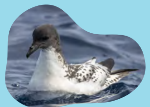
Antarctic Cape petrel / karetai hurukoko