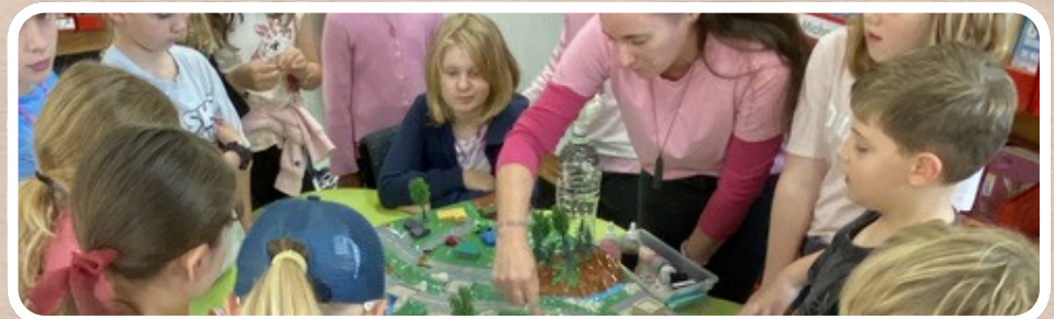
The Enviroscape is a 3D model of a water catchment, and this is a popular resource for schools exploring water in their local areas.