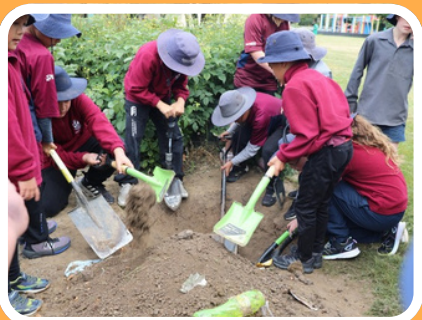
St Joseph's Oamaru's 'Big Dig' came to an end at the end of last year when they dug up all the rubbish they had buried in term 1 to see what would biodegrade and what wouldn't.