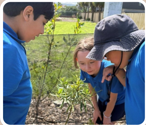
Ākoka at Musselburgh School take a closer look at the future monarch butterflies eating their way through the swan plants in their food forest.