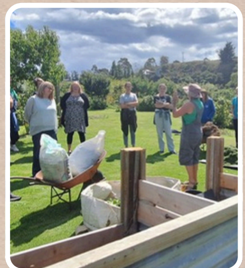
Waitaki Kaiako get the opportunity to learn more about composting systems within their school with Waitaki Community Gardens.