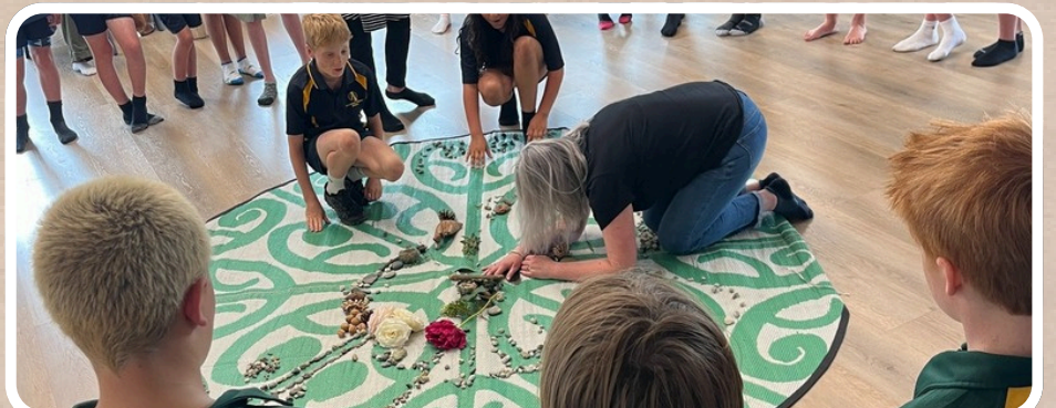
Central Otago ākoka were invited to join a drama activity, living the life of a piece of clothing, a battery and classroom stationery. Shockwaves were felt in the room as the koru artwork was used as the landfill - spoiling the hard mahi and the beauty the group had created.