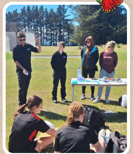
Learning how to be penguins with the Oamaru Blue Penguin Colony.

A massive thank you to the teachers at Waitaki Boys and Waitaki Girls for supporting the day, and to Waitaki Boys for hosting!