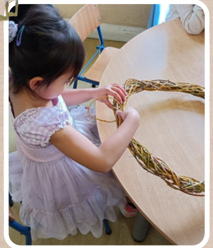
A young person at Maheno Kindergarten makes an atua inspired wreath for Matariki in 2025.

Kindergarten Associations play a key part in facilitating early childhood education along their Enviroschools journey. They support facilitators and lead teachers, and strengthen peer-to-peer learning within the sector. We are looking forward to what 2026 will bring for Ōamaru Kindergarten Association!