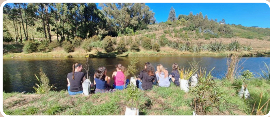
Ākoka take a break on the banks of the Ōtokia Creek on the sunny day of the Dunedin Secondary Hui.

As a break from the blazing sun, we held a planning session for the school groups about what they can achieve in their Envirogroups once back at school. This was an opportunity to take what they learned in the morning and decide the actions they will undertake with their peers.