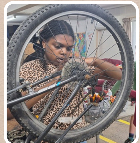
Ākoka learnt bicycle maintenance skills as a part of bicycle recycling at the Dunedin Enviroschools Hui.