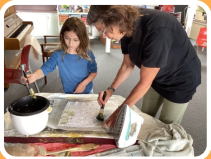
Waikouaiti School learnt how to make beeswax wraps as a part of reducing rubbish within their school.