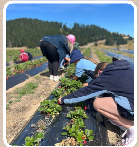
Ākoka get stuck in harvesting strawberries in preparation for making smoothies on a bike in Wānaka.

Wānaka ākoka got a hands on and belly filling day designed to bring elements of zero waste food, food resilience, composting, growing food and food security learning for the 30 ākoka attending. This day was rich in the Enviroschools Guiding Principles, giving ākoka the knowledge and skills that they can take to grow, buy, cook, and dispose of food sustainably.