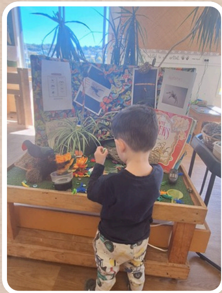
A young person plays with their adventure table during the Little Wonders Holistic Reflection.

At the end of the reflection, Leisa gifted the team with a 'Mischief' apple tree for their growing orchard. We hope it grows tall and fruits for many years to come!