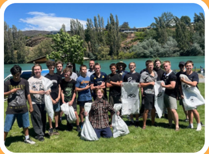
Dunstan High School ākoka had a day of volunteering and chose rubbish pick up on the banks of the Mata-Au.