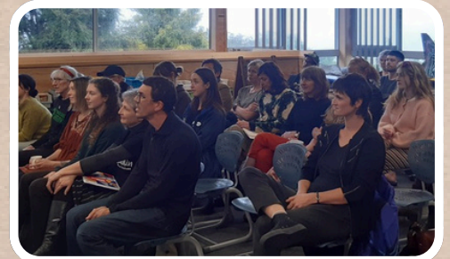
Key Kaiako from Dunedin Enviroschools got the opportunity to meet experts from around the city in February.