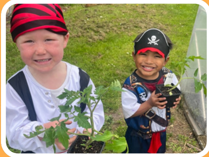
When Enviroschools actions happen even on costume day! Pirates get into the garden at Clutha Valley School.