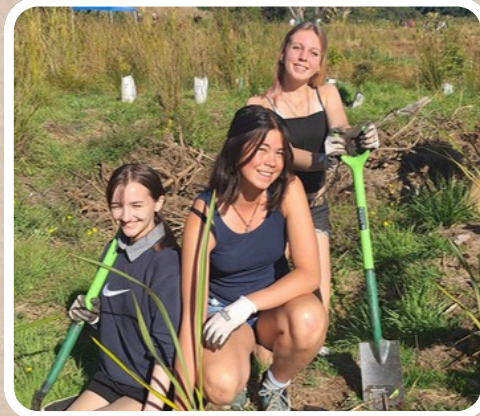
Secondary ākoka at the Dunedin Secondary Hui take a quick break while planting at Ōtokia Creek, supporting the local trust in their activities.