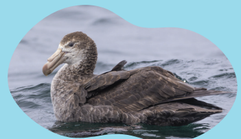
Northern giant petrel / pāngurunguru