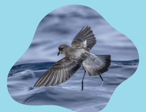
Grey-backed storm petrel / reoreo